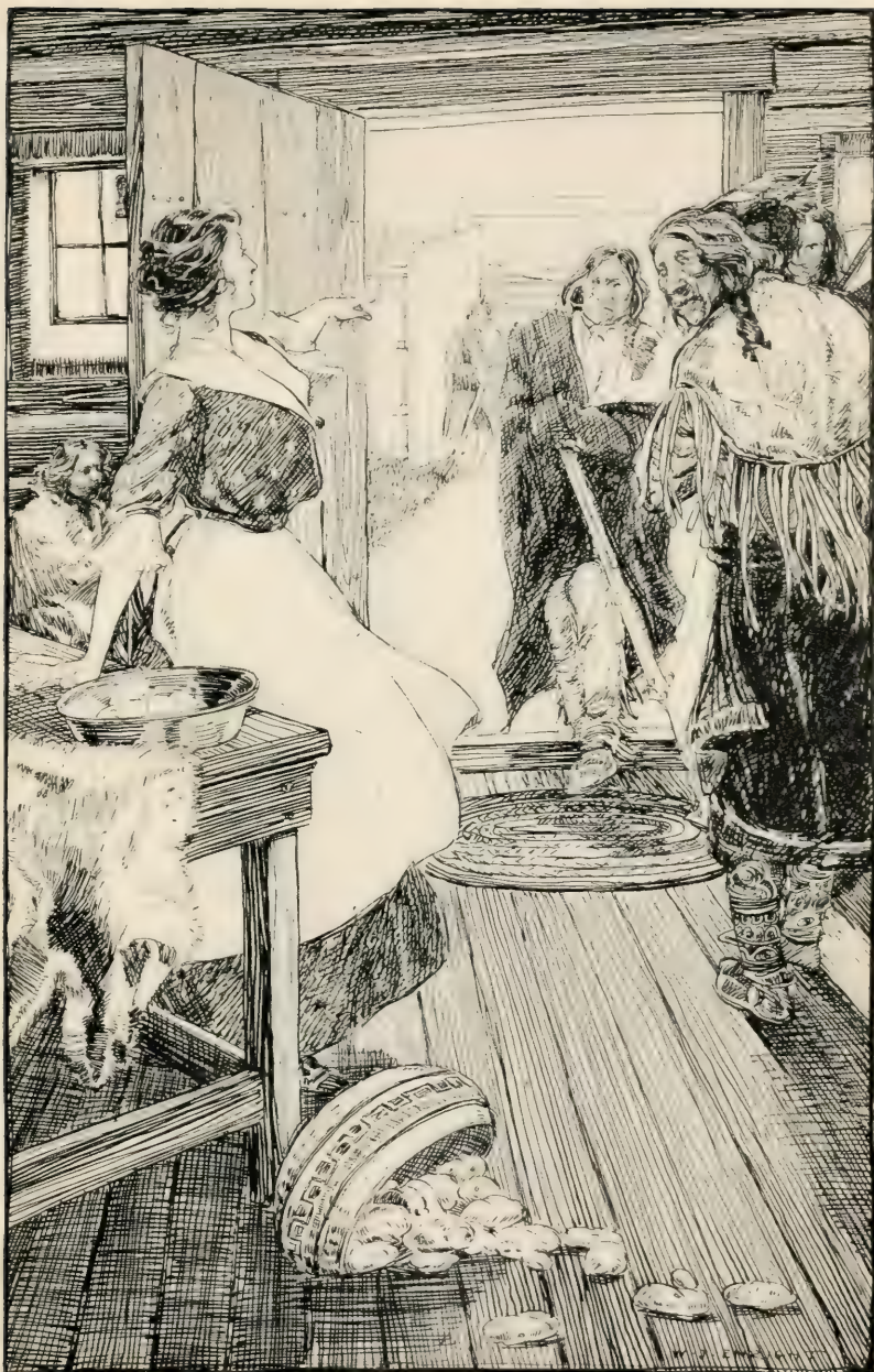
“She lifted her fair hand and her eye blazed as she pointed to the door.”